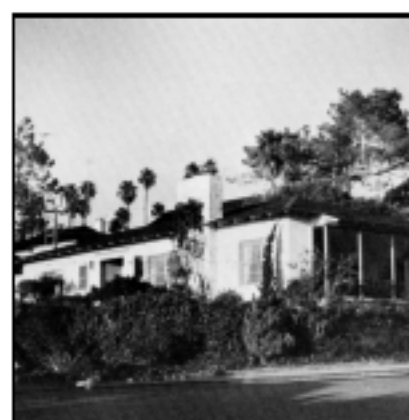
A place of literary history saved, page 24.