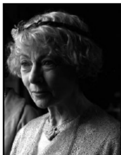
Harley Jane Kozak on TV, page 48.